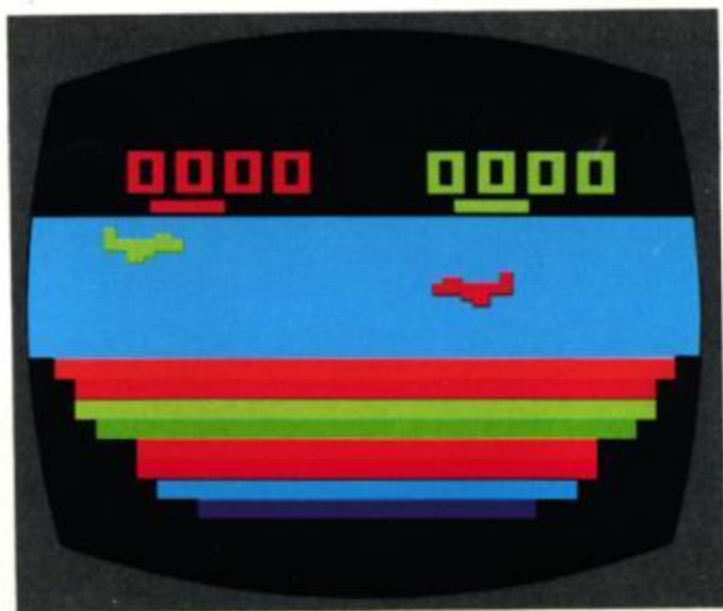
Canyon Bomber Playfield

In one-player Canyon Bomber games you compete against the computer for a higher score. A miss is recorded each time you fail to hit a target in the canyon. A miss is also recorded if your plane travels across the canyon without dropping a bomb.