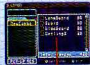
Best Combo Sequence

By editing your Pop-Up Message, you can change the message that's displayed when your Brother uses your Best Combo when you are On Air!